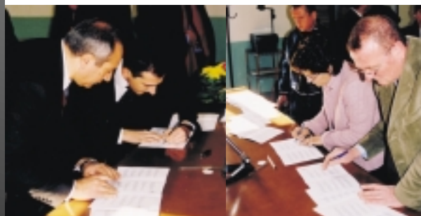
The signature of the RIBES Memorandum of Understanding in Pavia on 9 February 2005 - 18 Institutions officially signed it.

contributing to the national implementation of the GSPC (targets iii, viii, xiv, xvi).