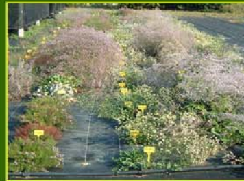
Fig. 1. Inventory of Limonium botanical species at the Experimental Institute for Floriculture, Pescia.