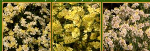
Fig. 6. Three examples of progenies obtained by crosses between L. sinensis and the commercial cultivars 'Lemon Star', 'Yellow Star' and 'Superlady'.

The last group derives from a new breeding program started in 2001 with crosses among L. aureum , L. sinensis , L. tetragonum , L. fortunei and the commercial cultivars 'Lemon Star', 'Yellow Star' and 'Superlady'. The first hybrids were obtained in 2002: they show both the good agronomical and ornamental characteristics of the parental cultivars and the stress tolerance of the parental botanical species. The best progenies are going to be cloned and cultivated in plots in the next year (Fig. 6).