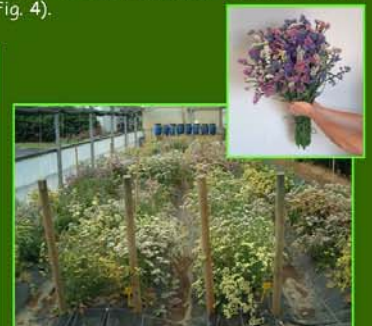
Fig. 4. Examples of different colour combinations of the calyx and the corolla in the hybrids L. bonduelli x L. sinuatum .

The third group derives from selected progenies of L. tataricum (Burchi et al. , 2003b). This species could not be crossed with any other species, so only one new variety was obtained by this breeding activity. This variety is a selection from free pollination of L. tataricum and is characterized by a good production, a high number of flowers per stem and a very attractive architecture of the inflorescence. The colour of calyx and the corolla is white: this is a typical characteristics of this variety because the colour of the corolla in L. tataricum is commonly pink or light-violet (Fig. 5).