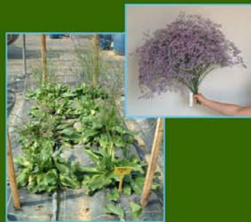
Fig. 2. The I.S.F. variety Violet Maury.