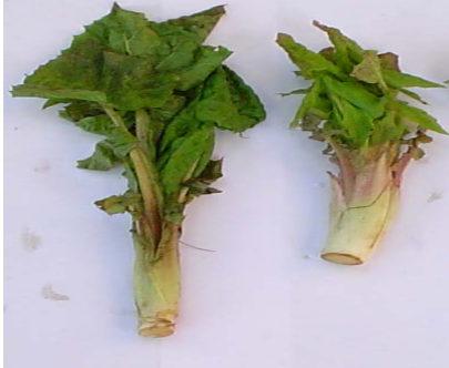
Fig. 2 Cicerbita alpina fresh shoots

Provinces (1). In this research, where, among other things, two reproduction systems were tested, the seed treated with hormones or not treated gave very poor germination (<3%), while adopting the root cutting technique > 50% of plants survived. Recently at the CRA-ISAFa satisfying germinating rates were obtained removing lighter seeds by means of an air-blower and treating them with 15 mg L -1 of Gibberellic acid (2). Furthermore the micro-propagation technique of this species was made ready (3).