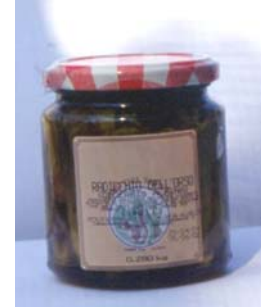
Fig. 3 Shoots of C. alpina canned