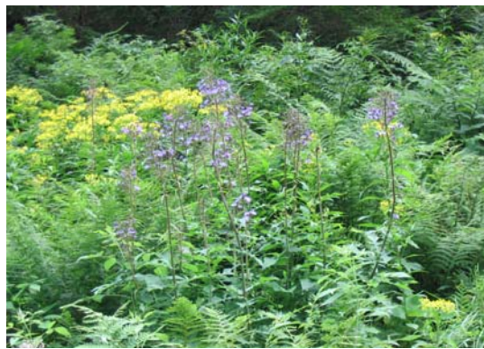
Fig. 1 Plants of C. alpina in their typical environment

Cicerbita alpina (L.) Wallr., usually known as Alpine blue-sow-thistle, is a perennial plant belonging to the Asteraceae family, commonly present in the sub-alpine and occasionally in the mountain plane of all the Alpine arc between 1,000 –2,000 m a.s.l.. As regards its ecology, it grows both in calcareous and in intermediate or siliceous soil, but prefers neutral pH conditions and wet and eutrophic environments (Fig. 1). These ecological conditions are typical of clearings, forest road edges and vallecucas. In Italy it is present but rare in the northern part of the Apennines too.